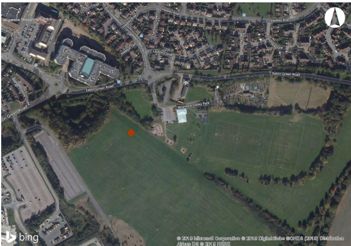
Inset 2: Wigmore Valley Park user count survey location

2.2.8 The location of user count surveys was selected during the first site visit. The chosen location is shown in Inset 2 . The location was selected because of its extensive 360-degree view over a large proportion of Wigmore Valley Park, including the car park, children's play area, skate facility and large open spaces in the north and west extent of the park. A limitation of the location is that it may not capture all users of the park, particularly those in the southern, more densely vegetated area. However due to the 15-minute duration of the survey, it is anticipated that most users would be recorded as they traverse through the open space.